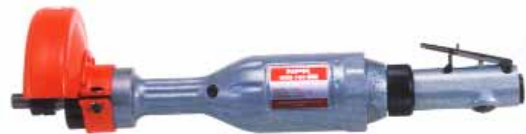
NHG-150LW Straight Grinder