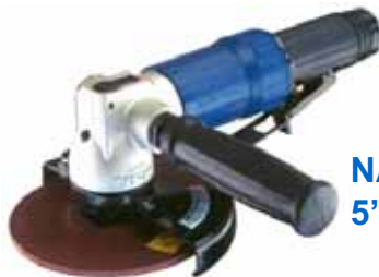
NAG-11A-U5 5" Angle Grinder

NAG-11A-U5 - Rear exhaust, spindle lock system, safety lever, spindle thread 5/8"-11 UNC. Right/Left replaceable handle. NAG-70ALW - Spindle thread 5/8"-11 UNC, safety lever, low sound level.