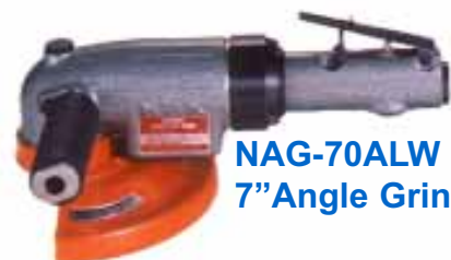
NAG-70ALW 7" Angle Grinder