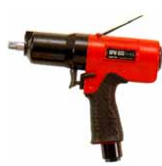
NPW-450A-T00 NPW-450A(S)-T00 Pulse Tool