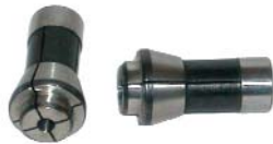
51224-1/8 1/8" Collet Insert

Fits AirPro 501, 512, 522, 529, 5120, 5220, 5120E, IR-301, and most "import" die grinders.