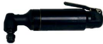
GA-1340-C Right Angled