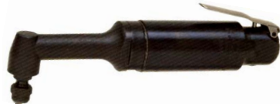
GAL-1340-C Ext. Right Angled