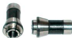
51224-1/4 1/4" Collet Insert