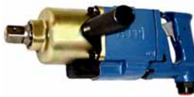
1034, 1040 & 1550 Series

EI - Inside Trigger (I.T.) EO - Outside Trigger (O.T.)