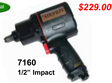
7160 1/2" Impact