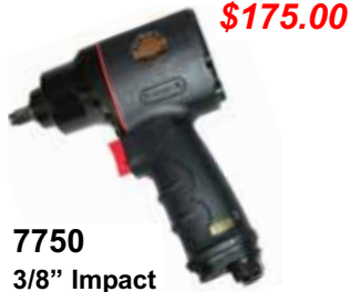
7750 3/8" Impact