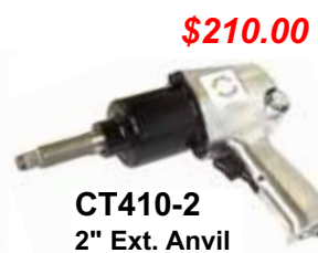
CT410-2 2" Ext. Anvil