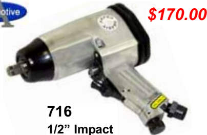
716 1/2" Impact