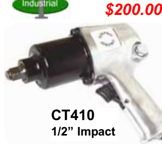
CT410 1/2" Impact