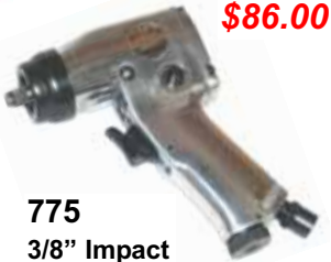
775 3/8" Impact