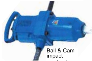
1578-LT-TH 1-1/2" Impact Wrench