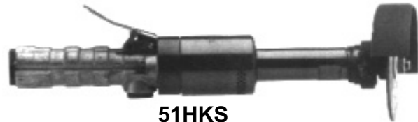
51HKS 57HKS (Governed)

Standard Equipment - 3" or 4" wheel guard, wheel washers, wrenches, spindle nut. RPM - Please specify.