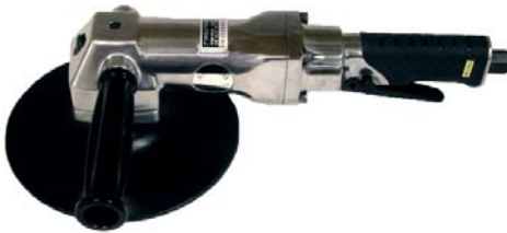
470 7" Angle Sander 472 7" Angle Polisher

Extra heavy gearing for heavy duty operation. Adjustable speed control allows delicate feather-edging to full speed Sanding.