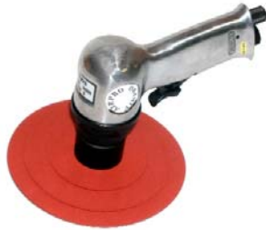
402 5" High Speed Sander

Designed for finishing flat or contoured surfaces. Ideal for touch-up, feather-edging.