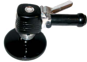
420 Dual Action Sander

Ball bearing construction, balanced counterweights and built-in speed regulator makes this sander ideal for metal preparation.