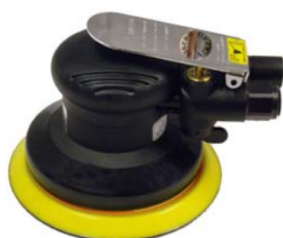
6309N-5 & 6309N-6 5" & 6" Random Orbital Sanders