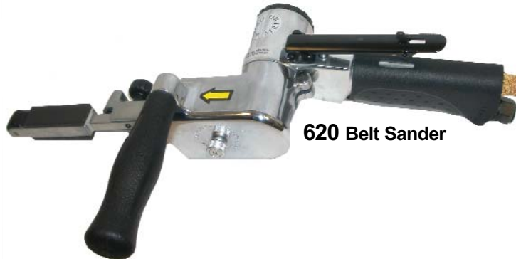
620 Belt Sander