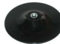
VP-70042 7" Plastic Backing Pad for Sanders & Polishers with a 5/8"-11 spindle thread.