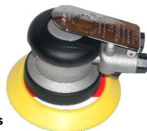
6050N-5 & 6050N-6 5" & 6" Random Orbital Sanders