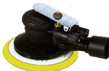
6309V-5 & 6309V-6 5" & 6" Random Orbital Sanders - c/w Central Vacuum Pick-up