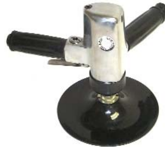
821 7" Vertical Sander

Extra heavy gearing for heavy duty operation. Adjustable speed control allows delicate feather-edging to full speed Sanding.