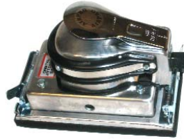
416 Jitterbug Sander

This heavy duty sander is ideal for body and paint shops. Constant orbital stroke provides a swirl-free finish. Powerful, fully enclosed motor. Balanced for vibration free performance. Ideal for wet or dry sanding.